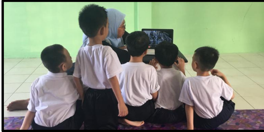
Children watch Formula 1 video